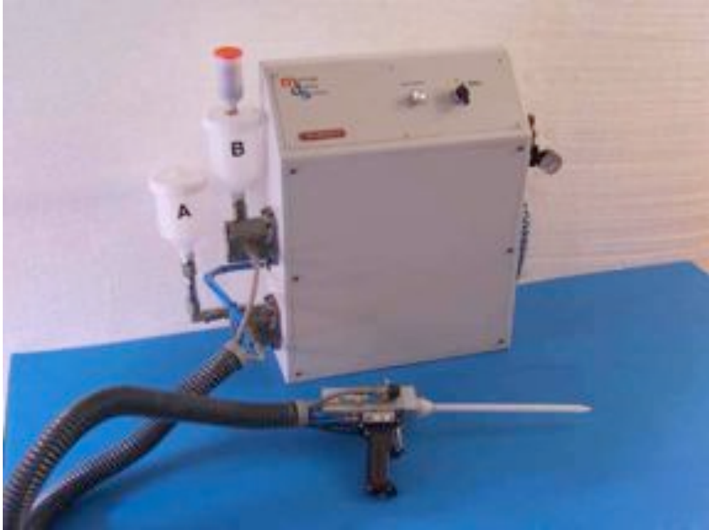
The MDS MiniDome 1

Precision single point dispense doming machine