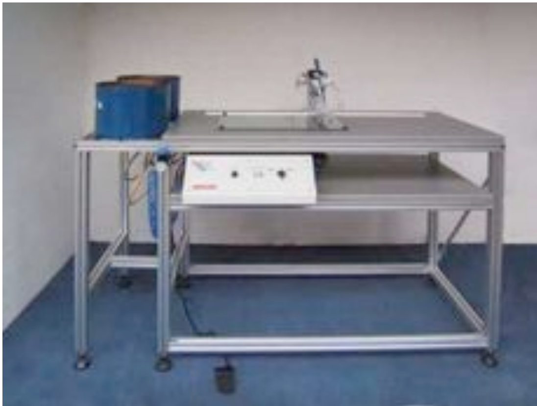
The MDS MiniDome 2

Multipoint dispensing for higher volume production of domed decals